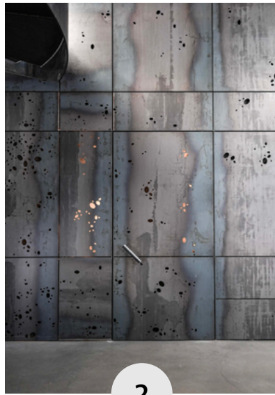
Door in closed position