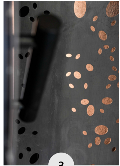
Any detailing of the door