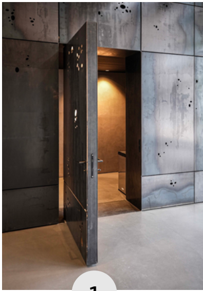
Door in open position

The photographs that are uploaded as entries need to be of high quality (professional) in a finished surrounding and not in an under-construction setting. You may upload more than 3 photographs or videos of the door that portrays its functionality. There should be a minimum of 3 images of the following shots: